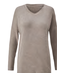
#3052 Serenity Tee (heather taupe) XXS-XL USA 79 | CAN 89 | UK 62