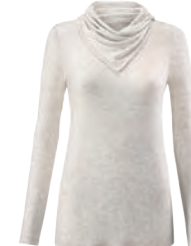
#3226 Sawyer Tee XS-XL USA 86 | CAN 106 | UK 68 p. 30