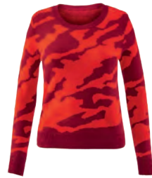
#3158 Camo Pullover XS-XL USA 109 | CAN 139 | UK 84 p. 05