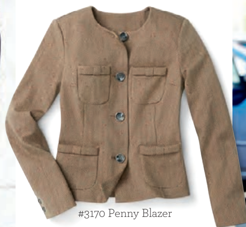
#3170 Penny Blazer