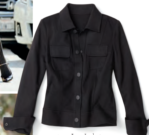
#3174 Ava Jacket

#3160 Ballet Sweater #3278 Monaco Cami #3218 Utility Skirt #2091 Cameo Earrings #2092 Cameo Necklace