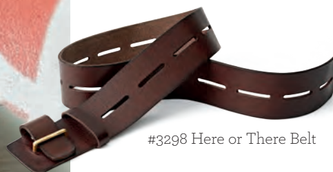
#3298 Here or There Belt

One belt, two ways! Wear the Here or There Belt slung low on your hips or at your true waist.