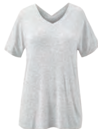
#5062 Double-V Tee (light heather gray) XS-XL USA 76 | CAN 96 | UK 59