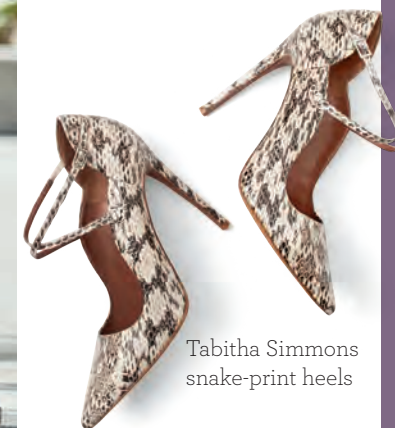
Tabitha Simmons snake-print heels