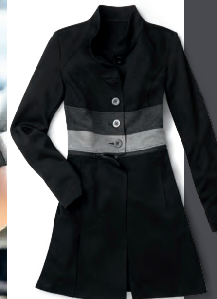
#3176 Convertible Jacket

Our Convertible Jacket adapts to any season. Try it short or long, dressy or casual. 💡