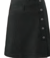
#3218 Utility Skirt 0-16 USA 89 | CAN 109 | UK 69 pp. 11, 16, 18, 22, 24, 27