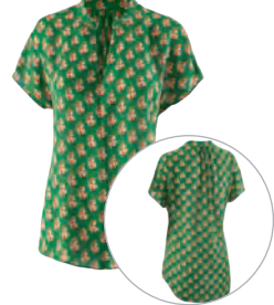
#3252 Stevie Top XS-XL USA 84 | CAN 104 | UK 66 p. 28