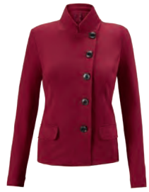
#3175 Outing Blazer 0-16 USA 159 | CAN 199 | UK 124 p. 05