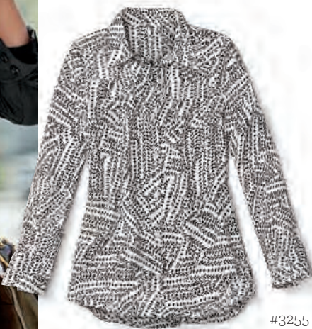
#3255 Split-Back Blouse

Match the Utility Top with the Ava Trouser for an on-trend anti-suit. 💡