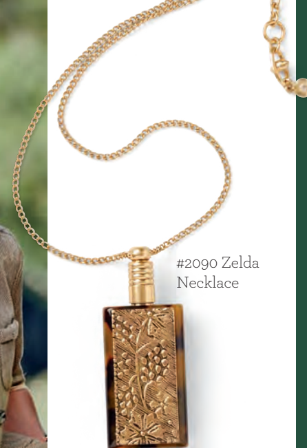
#2090 Zelda Necklace

#3170 Penny Blazer #3276 Zoe Top #3197 Skinny Cord