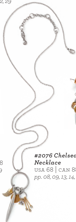
#2076 Chelsea Charm Necklace USA 68 | CAN 88 | UK 52 pp. 08, 09, 13, 14, 20, 21, 26