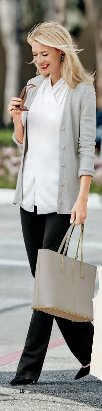
#3278 Monaco Cami