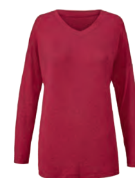
#3052 Serenity Tee (heather red) XXS-XL USA 79 | CAN 89 | UK 62