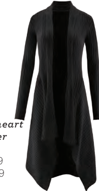
#3164 Sweetheart Sweater XS-XL USA 139 CAN 179 UK 108 p. 29