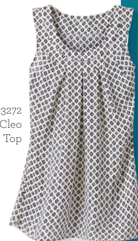
#3272 Cleo Top

#3182 Quilted Jacket XS-XL USA 139 | CAN 179 | UK 108 #3272 Cleo Top #3189 New Crop #2070 Rock Star Earrings