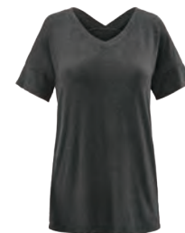
#5062 Double-V Tee (heather black) XS-XL USA 76 | CAN 96 | UK 59