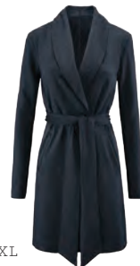
#3180 Harbor Jacket XS-XL USA 189 CAN 239 UK 149 pp. 06, 20, 23