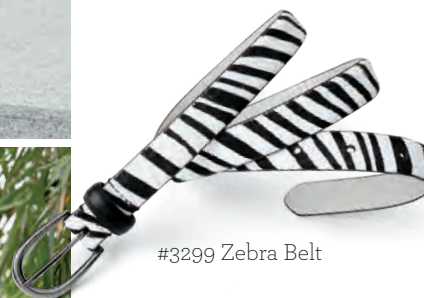
#3299 Zebra Belt

#3232 Utility Top #3201 Ava Trouser (black) #2089 Zelda Cuff (x2)