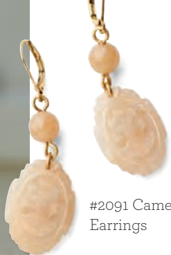
#2091 Cameo Earrings