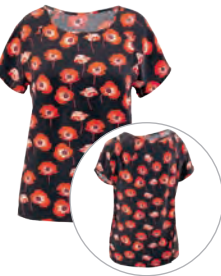
#3251 Flanders Top XS-XL USA 79 | CAN 99 | UK 62 p. 04