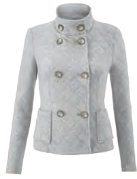
#3182 Quilted Jacket XS-XL USA 139 | CAN 179 | UK 108 p. 23