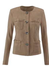
#3170 Penny Blazer XS-XL USA 149 | CAN 189 | UK 119 pp. 12, 14, 31