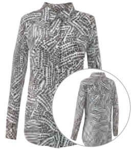
#3255 Split-Back Blouse XS-XL USA 99 | CAN 119 | UK 78 pp. 24, 26