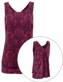
#3258 Cameo Top XS-XL USA 84 | CAN 104 | UK 66 pp. 05, 07