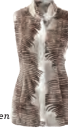
#3179 Aspen Vest XS-XL USA 149 CAN 189 UK 119 p. 21