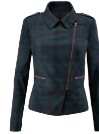
#3181 Tartan Jacket 0-16 USA 169 | CAN 209 | UK 129 pp. 20, 22