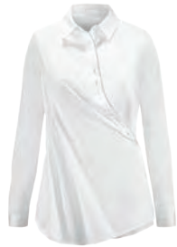
#3291 It's a Wrap Shirt XS-XL USA 98 | CAN 128 | UK 76 pp. 17, 19