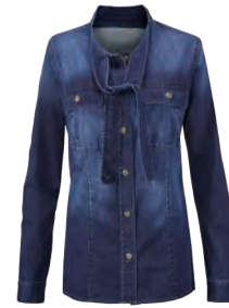
#3290 Waterfront Shirt XS-XL USA 98 | CAN 128 | UK 76 pp. 15, 21