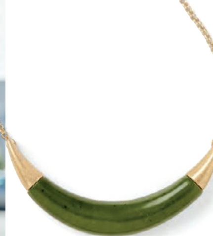
#2075 Jasper Crescent Necklace

#3232 Utility Top #3201 Ava Trouser (black) #2089 Zelda Cuff (x2)