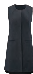
#3178 Drafting Vest XS-XL USA 149 CAN 189 UK 119 p. 17