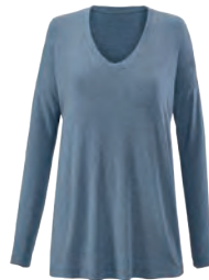
#3229 Relax Tee XXS-XL USA 84 | CAN 104 | UK 66 pp. 09, 11