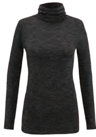
#3225 Odyssey Turtleneck XS-XL USA 64 | CAN 84 | UK 49 p. 11