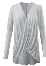
#3245 Taylor Tee XXS-XL USA 89 | CAN 109 | UK 69 p. 22