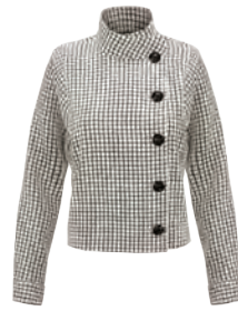
#3173 Windowpane Jacket XXS-XL USA 169 | CAN 209 | UK 129 pp. 10, 25