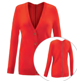
#3155 Cobblestone Cardigan XS-XL USA 98 | CAN 128 | UK 76 pp. 04, 07