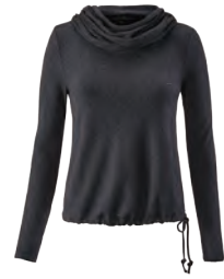
#3231 Recess Topper XS-XL USA 99 | CAN 119 | UK 78 p. 09