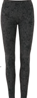
#3212 Safari Legging XS-XL USA 99 CAN 119 UK 78 pp. 08, 17