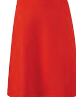
#3219 Fiery Skirt 0-16 USA 89 | CAN 109 | UK 69 pp. 05, 07, 43