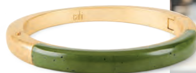
#2074 Jasper Bangle

#3176 Convertible Jacket #3266 Jagger Blouse #3195 Lace Skinny curvy fit #3196 #2076 Chelsea Charm Necklace