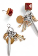
#2073 Pyramid Charm Earrings USA 49 | CAN 59 | UK 38 pp. 04, 05, 09, 11, 13, 15, 16, 21 Wear these earrings as simple studs or decked out in charms.