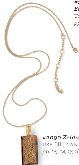
#2090 Zelda Necklace USA 68 | CAN 88 | UK 52 pp. 05, 14, 17, 18, 19, 24, 25, 29, 31