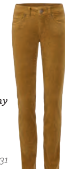
#3197 Skinny Cord 0-16 USA 109 CAN 139 UK 84 pp. 14, 19, 28, 31