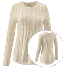
#3157 Lace-Up Sweater XS-XL USA 139 | CAN 179 | UK 108 p. 29