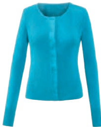
#3169 Darby Cardigan XS-XL USA 89 | CAN 109 | UK 69 pp. 21, 22