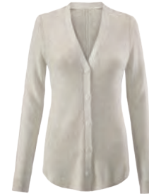
#3161 Shirttail Cardigan XS-XL USA 119 | CAN 149 | UK 94 pp. 16, 18, 30