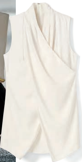
#3259 Wraparound Top

#3161 Shirttail Cardigan #3259 Wraparound Top O-16 USA 99 | CAN 119 | UK 78 #3202 Top-Notch Trouser #2070 Rock Star Earrings