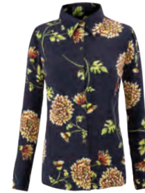
#3250 Daisy Blouse XS-XL USA 99 | CAN 119 | UK 78 p. 12