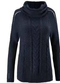
#3168 Cable Cowl XS-XL USA 119 | CAN 149 | UK 94 p. 13