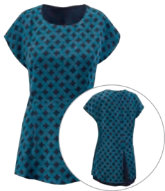
#3274 Foulard Top XS-XL USA 89 | CAN 109 | UK 69 pp. 20, 22