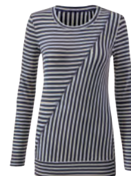
#3228 Ernest Tee XS-XL USA 89 | CAN 109 | UK 69 pp. 13, 14