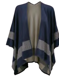
#3163 Reversible Wrap Sweater XS/S; M/L USA 129 | CAN 159 | UK 99 pp. 12, 15