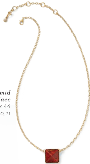
#2072 Pyramid Necklace USA 58 | CAN 68 | UK 44 pp. 04, 10, 11