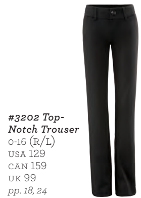
#3202 Top-Notch Trouser 0-16 (R/L) USA 129 CAN 159 UK 99 pp. 18, 24