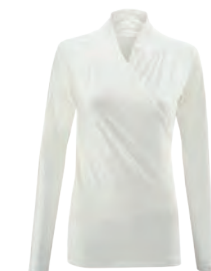
#3185 Wrap Tee (white) XS-XL USA 69 | CAN 89 | UK 54