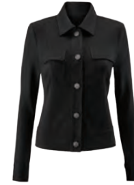
#3174 Ava Jacket XS-XL USA 149 | CAN 189 | UK 119 pp. 06, 16, 19, 27, 30