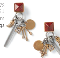
#2073 Pyramid Charm Earrings