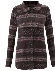
#3249 Paris Blouse XS-XL USA 94 | CAN 114 | UK 72 p. 17