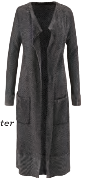
#3166 Lara Sweater XXS-XL USA 159 CAN 199 UK 124 p. 13