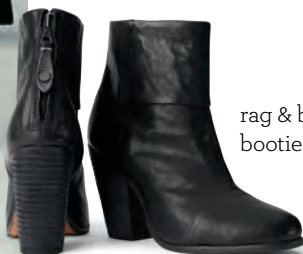
rag & bone booties

#3181 Tartan Jacket #3266 Jagger Blouse #3218 Utility Skirt