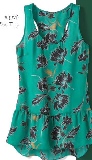
#3276 Zoe Top

#3170 Penny Blazer #3276 Zoe Top #3197 Skinny Cord