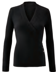
#3160 Ballet Sweater XS-XL USA 99 | CAN 119 | UK 78 pp. 18, 23, 25