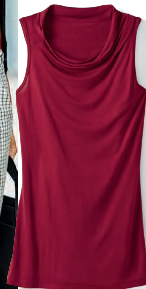
#3244 Cute Tee

#3174 Ava Jacket #3244 Cute Tee XS-XL USA 74 | CAN 94 | UK 58 #3299 Zebra Belt #3203 Windowpane Trouser