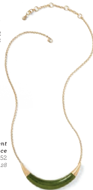
#2075 Jasper Crescent Necklace USA 68 | CAN 88 | UK 52 pp. 25, 26, 32, 28