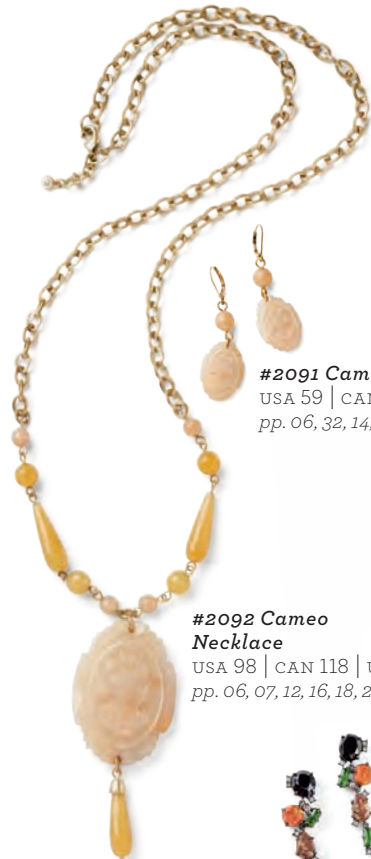
#2091 Cameo Earrings USA 59 | CAN 69 | UK 46 pp. 06, 32, 14, 17, 18, 19, 22, 29