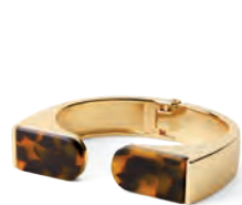
#2089 Zelda Cuff USA 59 | CAN 69 | UK 46 pp. 05, 32, 14, 17, 18, 21, 23, 24, 25, 26, 30