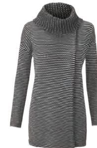
#3167 Fergie Turtleneck XXS-XL USA 139 | CAN 179 | UK 108 p. 08