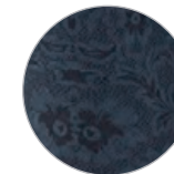
#3195 Lace Skinny 0-16 USA 109 CAN 139 UK 84 pp. 10, 14, 21, 22, 26