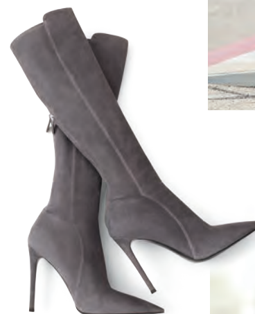
Prada knee-high boots

Switch out booties for a sleek pair of knee-high boots when the weather gets chilly.