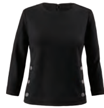
#3232 Utility Top XS-XL USA 109 | CAN 139 | UK 84 pp. 24, 26