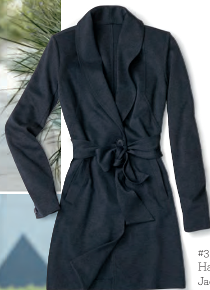
#3180 Harbor Jacket

#3169 Darby Cardigan #3274 Foulard Top #3193 Dusk Destroyed Skinny curvy fit #3194