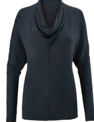
#3227 Quinn Tee XS-XL USA 84 | CAN 104 | UK 66 p. 14