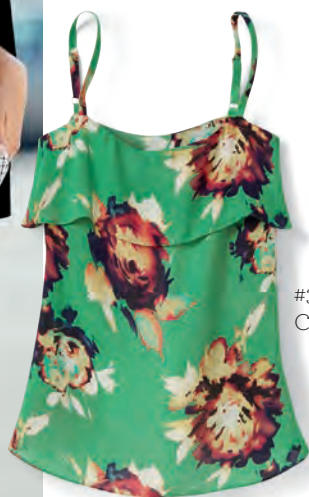
#3264 Bloom Cami

#3174 Ava Jacket #3264 Bloom Cami #3299 Zebra Belt #3203 Windowpane Trouser