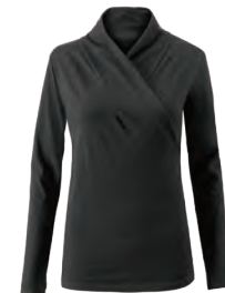
#3185 Wrap Tee (black) XS-XL USA 69 | CAN 89 | UK 54