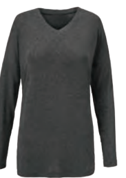
#3052 Serenity Tee (heather black) XXS-XL USA 79 | CAN 89 | UK 62