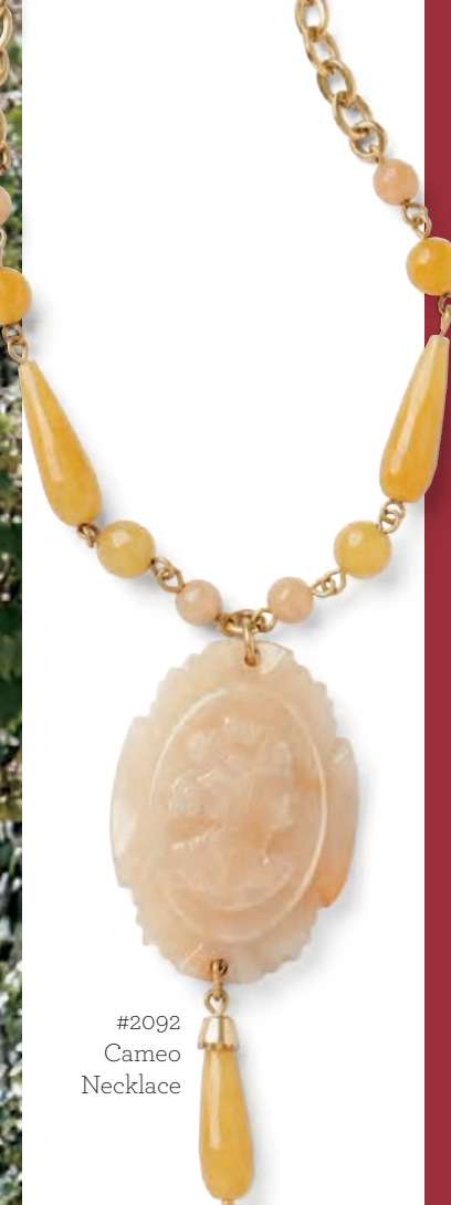
#2092 Cameo Necklace