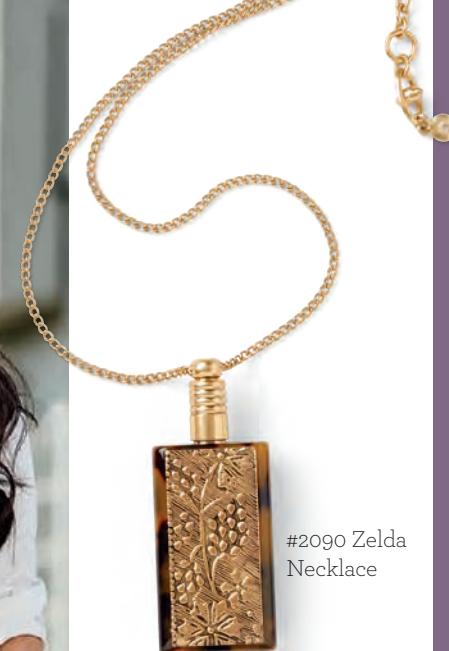
#2090 Zelda Necklace

#3291 It's a Wrap Shirt #3197 Skinny Cord #2091 Cameo Earrings