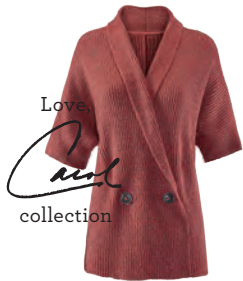
#3162 Rosewood Sweater XXS-XL USA 149 | CAN 189 | UK 119 pp. 04, 11